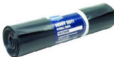
Heavy duty rubble bags.