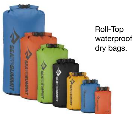
Roll-Top waterproof dry bags.